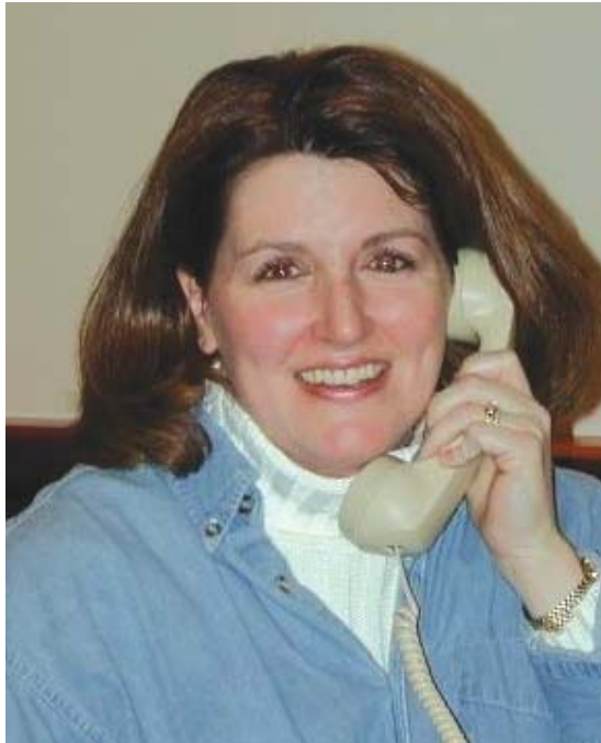
HNE associates volunteered their time to work the phones for the Children's Miracle Network Radiothon.

Y ou knew that HNE was a member of the community, but did you know that we are committed to making our community a better place? As a local business with its origin and roots in Western Massachusetts, a major part of HNE's mission is to support our community. Whether through sponsorship of local events, direct support of local agencies, or through our associates—working side by side with their friends and neighbors to promote local causes and activities—HNE is there to make a difference where we live and work.